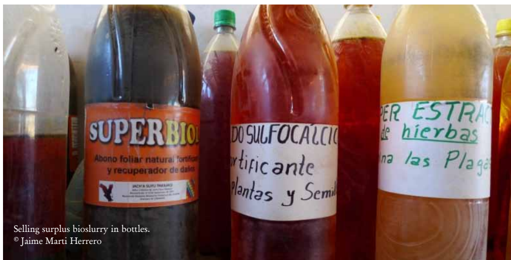
Selling surplus bioslurry in bottles.

The energy balance of B is not reported. However, it is likely to be closer to the balance of fresh manure than that of synthetic fertilizer. Bearing the uncertainties of determining an energy balance in mind, the energy used to produce one kilogram of SF is around 100 to 300 times larger than for producing one kilogram of fresh manure. Given these very large differences, it seems worthwhile to conduct research on the energy balance of B to determine the potential of reducing GHG emissions and saving fossil fuel energy and related costs. Increasing fossil fuel prices will make fossil fuel based fertilizers' price more and more expensive and volatile, which will directly impact those smallholder farmers that currently depend on them.