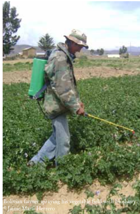
Bolivian farmer spraying his vegetable field with bioslurry.

One positive exception is an educational video published by SNV, Vietnam (SNV, 2008), which gives a detailed explanation of how B should be applied to different crops (rice, maize, wheat, spring peanuts), vegetables (cabbage, kohlrabi, green cabbage, tomato), fruits ( Malpighia glabra , durian), tea, coffee and ornamental flowers.