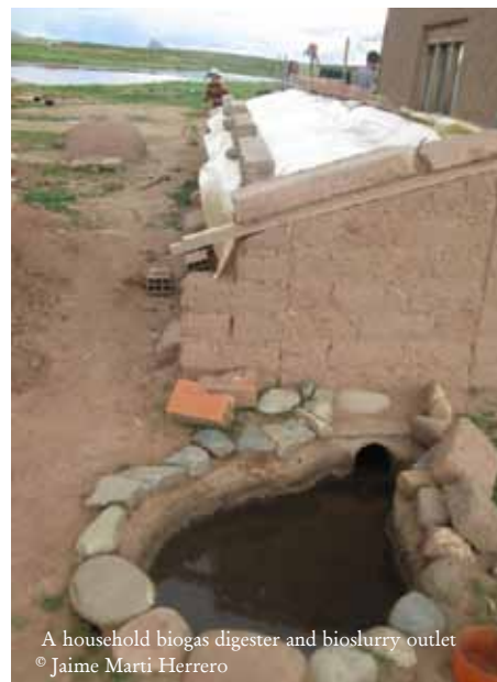
A household biogas digester and bioslurry outlet