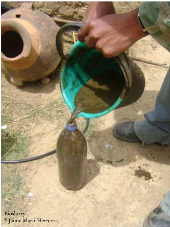
Bioslurry

This review will focus on the properties and different uses of the liquid effluent, the bioslurry (B).